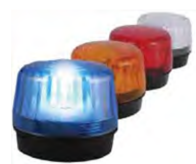
For industrial environments or applications where wide area visual indication is required, substitute the 1127 Visual Alerter with Algo's